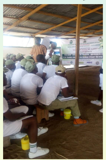
Team Taraba during the training session