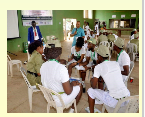
Team Lagos during the group assignment

Following the flag off ceremony of the NYSC Peer educator programme in Plateau State, a Training of Trainers (TOT) session held across 12 pilot states in the country including Abia, Anambra, Edo, Gombe, Kano, Kwara, Lagos, Oyo, Plateau, Rivers, Sokoto, and Taraba.