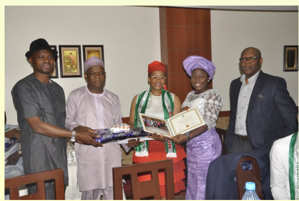
Presentation of gifts to AFI delegates during the farewell ceremony