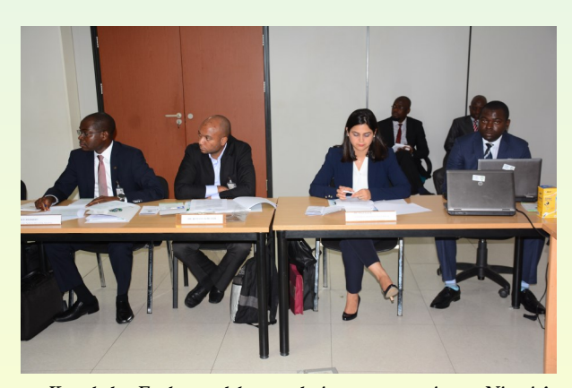
Knowledge Exchange delegates during a presentation on Nigeria's Financial Inclusion policies.