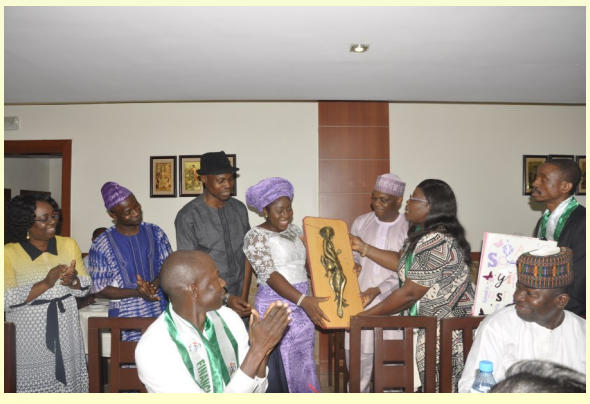
AFI Delegates presents an appreciation gift to Financial Inclusion Secretariat during the farewell ceremony