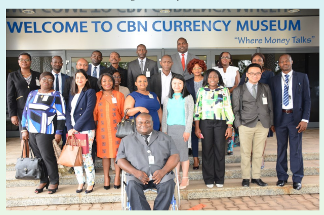
Delegates visit the CBN Currency Museum