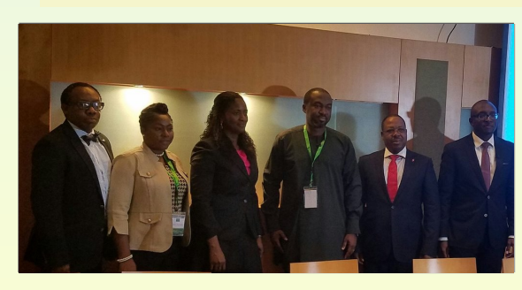
Facilitators at the Workshop

The Cuici International held its 2nd Retail Banking Workshop on the June 15, 2017 in Lagos.