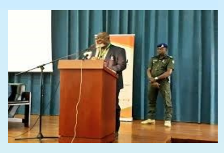
Barrister Abdur-Raheem Adebayo Shittu, Honarable Minister of Communications delivering his keynote address at Summit