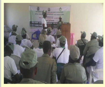
NYSC Volunteer delivering a presentation to his peers in Gombe state